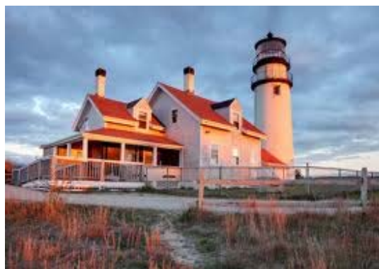
A 6-day excursion to Cape Cod with visits to Martha's Vineyard, Sandwich & Boston, MA; Newport, RI; and Bangor.