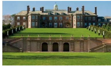
Crane Estate, Ipswich, MA