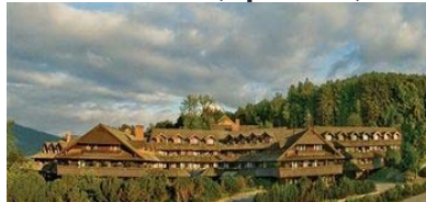
Von Trapp Family Lodge