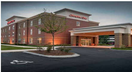
Hampton Inn, Augusta, ME

To register for this delightful tour, please complete a Registration Form (available on our website ( showcaseproductions.ca ) and forward it to us at the following address: SHOWCASE PRODUCTIONS SOCIETY 149 East Victoria Street Amherst, NS B4H 1Y2