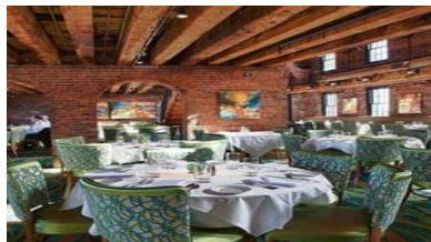
Chart House Restaurant, Boston

Contact us at: SHOWCASE PRODUCTIONS SOCIETY 149 East Victoria Street Amherst, NS B4H 1Y2 E-mail: showcasep@eastlink.ca Tel: (902) 667-1900