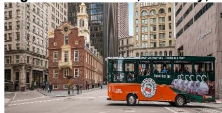
Hop-On-Hop-Off Bus, Boston, MA